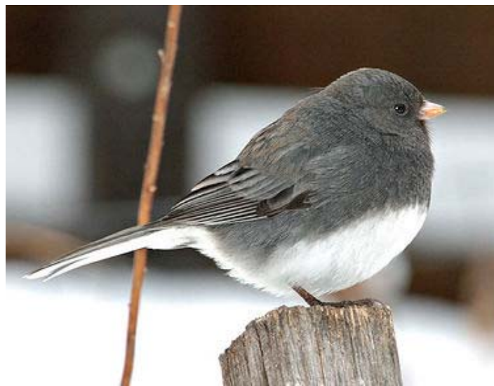
(Winter Field Trip, continued from page 1)

There are a number of options for accommodations in the area but it might be best to have everyone together in one place, at the Inlet Inn in Beaufort. The hotel is right on the waterfront and if we book ten rooms, they will give us a ten percent discount on each room. See http://www.inlet-inn.com for further information. Call 800-554-5466 for reservations, and be sure to tell them you are with Forsyth Audubon. If we don't get commitments for ten rooms by the end of December, then we'll make information available on other options.